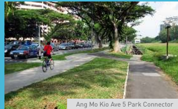
Ang Mo Kio Ave 5 Park Connector