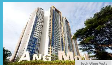
Teck Ghee Vista