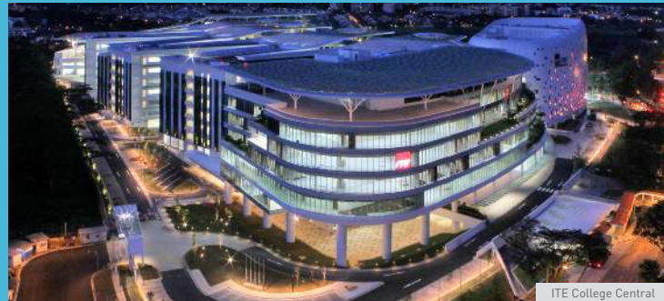
ITE College Central