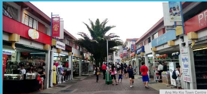
Ang Mo Kio Town Centre

For more information and photo credits, visit the Draft Master Plan 2013 exhibition website at www.ura.gov.sg/MS/DMP2013 .